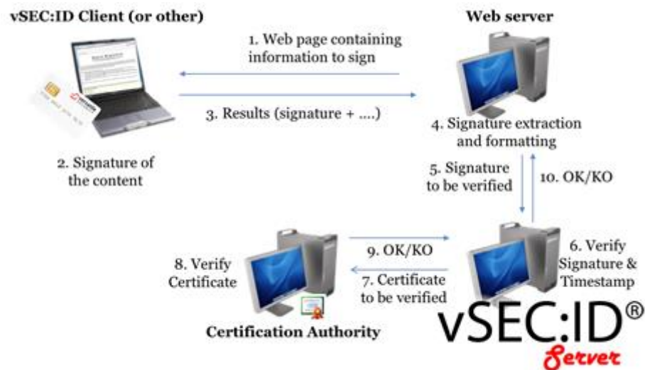
Figure 2: vSEC:ID® Server example – Digital Signature Verification