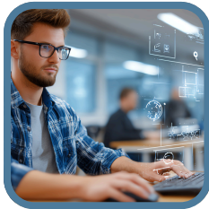
Admin starts order in vSEC:CMS

Admin Experience: No need for manual shipping or registration. Save on time, labor and costs.